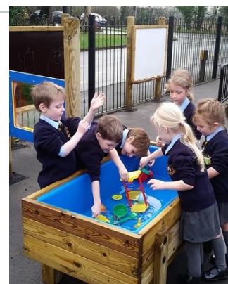
Enabling everyone to flourish

'Hawkesbury Primary School is a fantastic village school! I was nervous that needs and opportunities would not be met at a smaller school but the dedication, care and effort that everyone involved in the school puts into the pupils is fantastic, with results above and beyond expectation. I cannot recommend the school enough'